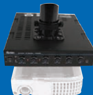
Projector Not Included

Atlas Sound's patent pending pole mount design allows unit to be mounted above the classroom projector system